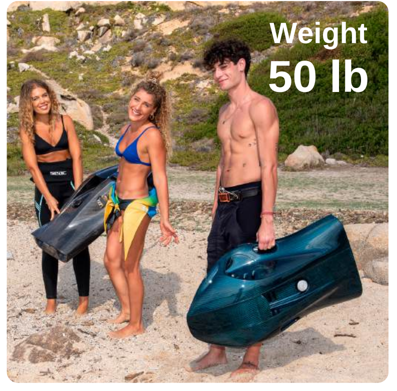
Six horsepower (4.4 kW) with dual motors for hydrodynamics, maneuverability, and a top speed of 13 mph.